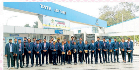
Visit to TATA Motors Plant