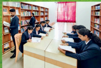
Well Stocked Library