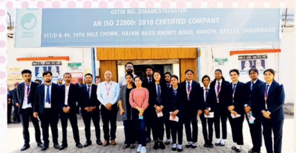
Visit to Parle Biscuit Factory