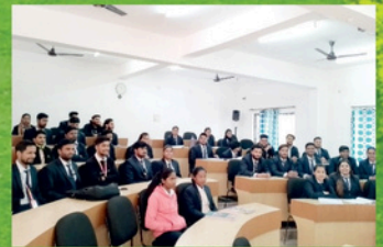
Theatre Style Classroom