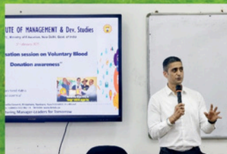
Extra Curricular Activities