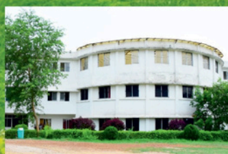
In Campus Hostel