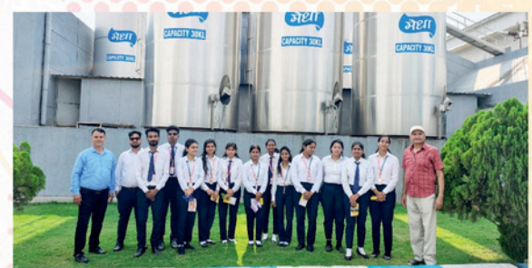
Visit to Medha Dairy Plant

Join KIMDS – Where Manager-Leaders are Nurtured for Tomorrow.