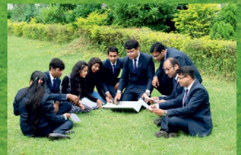
Lush Green Campus